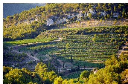
The "restanques" of Pibarnon