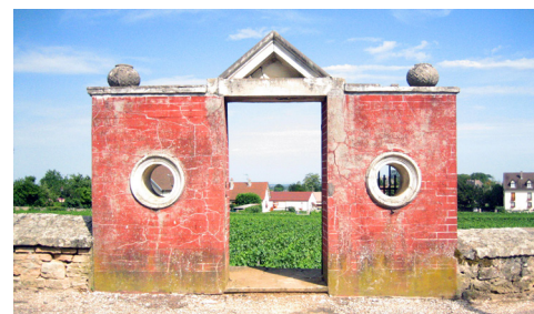
The gates of 'Clos Village,' across from the family cellars